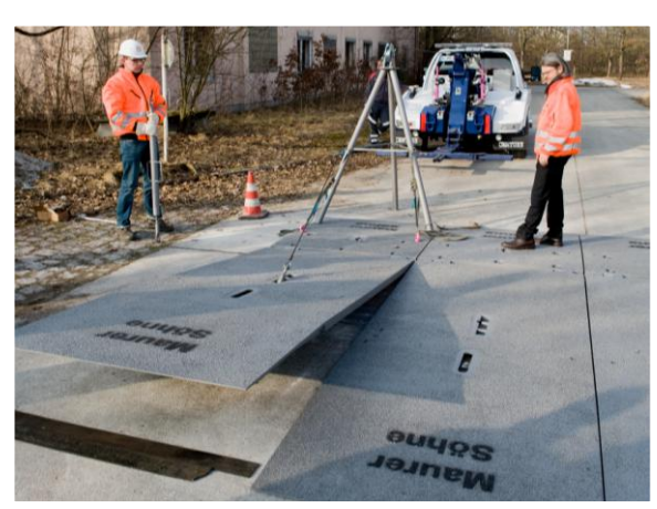
Fig 2: Opening with wrench and tripod