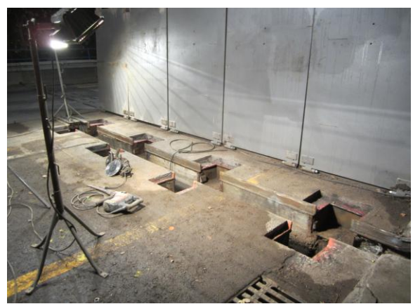
Fig 4: Job site