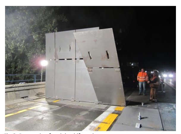
Fig 3: Preparation for night shift works