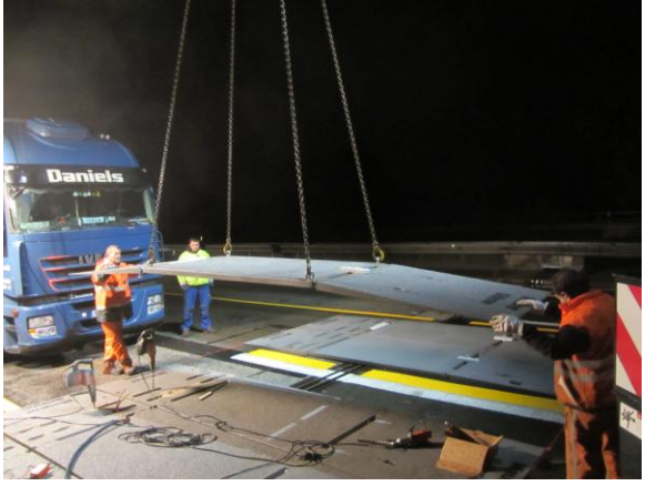
Fig 1: Set up while road is closed

of the so called box-in-box solution. Because this bridge is considered to be a focal point in local traffic, a conventional closing down of this bridge would have caused major traffic jams. By way of the MMBS system, the replacement works at the expansion joint was carried out between 19.30 hrs and 06.00 hrs. During daytime, the traffic could flow over the job site at a speed of 70 km/h.