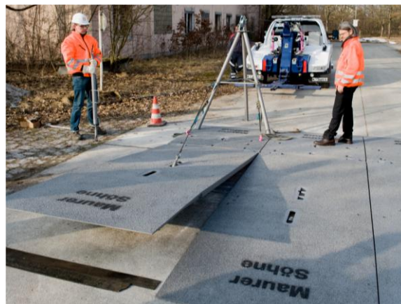
Fig 2: Opening with wrench and tripod