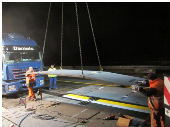
Fig 1: Set up while road is closed

of the so called box-in-box solution. Because this bridge is considered to be a focal point in local traffic, a conventional closing down of this bridge would have caused major traffic jams. By way of the MMBS system, the replacement works at the expansion joint was carried out between 19.30 hrs and 06.00 hrs. During daytime, the traffic could flow over the job site at a speed of 70 km/h.