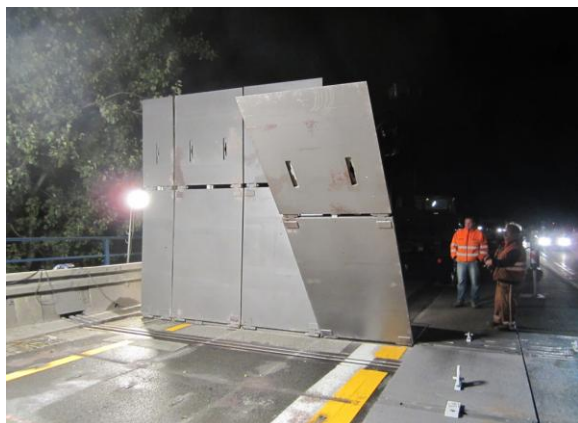
Fig 3: Preparation for night shift works